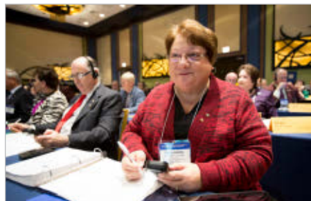
The Rotary Council on Legislation voted to let clubs amend their bylaws to vary meeting days and times.

No. The Council action did not explicitly remove or modify the existing rules and traditions in Rotary's governing documents. Any club that still wishes to follow the traditional requirements for meetings, attendance, structure, and categories of membership may continue to do so.